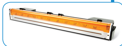
Memjet® print head has 70,400 ink nozzles for higher speeds, lower ink use and less noise than standard print heads