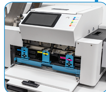
Clamshell design offers easy front access to ink tanks and paper path