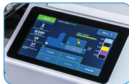
Intuitive 7" color touchscreen displays system status, image preview, and provides access to stored jobs