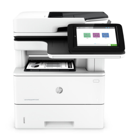
HP LaserJet Managed MFP E52645dn

Choose an HP LaserJet Enterprise MFP designed to handle business solutions securely and efficiently, and helps conserve energy with HP JetIntelligence toner. Keep up with the demands of growing business with a printer you can rely on.