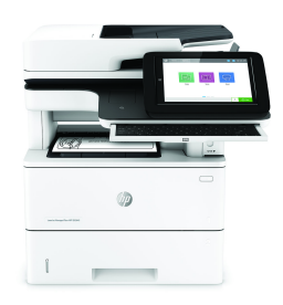
HP LaserJet Managed Flow MFP E52645c